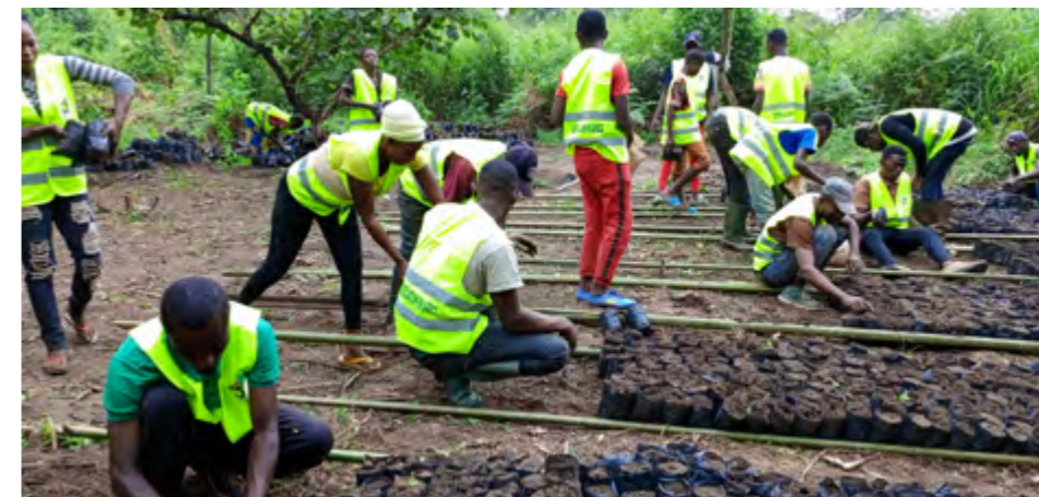
World Resources Institute / Blessed Action for Africa