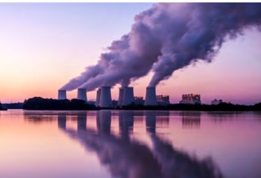
Client Earth

Having developed a portfolio of beneficiaries within this field, the Trustees now focus their grant-making in three sub-categories: ‘coal-to-clean’, carbon disclosure, and natural solutions. Although these are widely used terms, this classification is somewhat artificial; in practice, many of these organisations work across more than one of these three sub-categories.