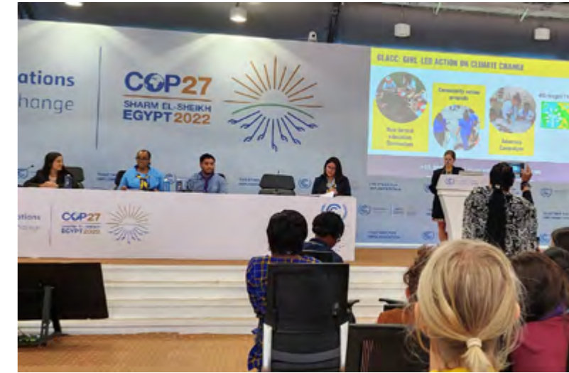
World Association of Girl Guides and Girl Scouts: Advocacy champion speaking at COP27 in Sharm-El Sheikh

In early 2022 the Foundation made a further grant to WAGGGS, towards the work of member organisations in Eastern Europe that are responding directly to the Ukrainian refugee crisis.