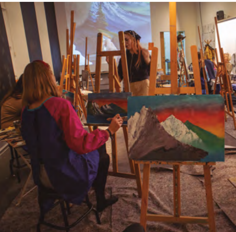
Painting workshop at stART at SKMU Sørlandets Kunstmuseum