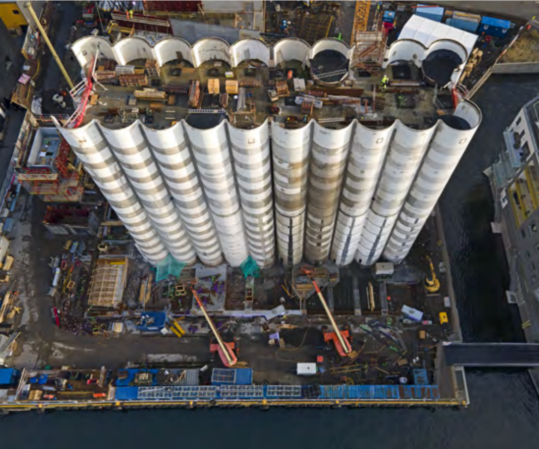
AKO Kunststiftelse – aerial view of the Kunstsilo