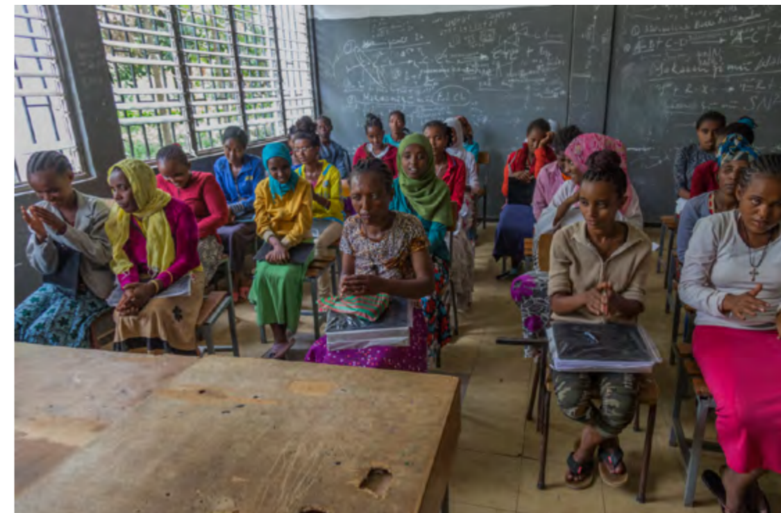
Partnership for Change

After years of civil war and disease, Liberia faced the twin problems of several cohorts of under-educated young people, and one of the lowest rates of public expenditure per capita on education of any country. Social Finance, a UK non-profit entity, acts as project manager for 'LEAP' – Liberian Education Advancement Programme. This is an innovative programme whereby the Liberian Ministry of Education has outsourced the management of a significant proportion of the country's schools to third-party operators, with a view to identifying a replicable model or models, and to raising standards nationally. The Foundation is one of a small group of major funders supporting this programme.